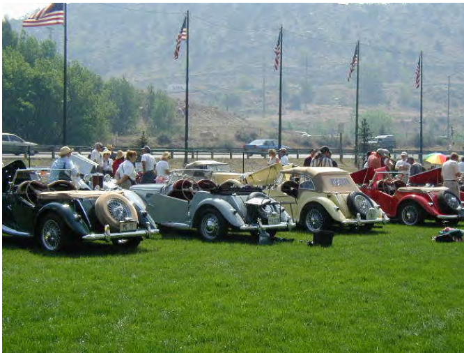
A fine day for the car display on the grass at Santa Rita Park on the Animas River

quickly settled into a fun week of cars, surroundings and the companionship of fellow enthusiasts. On the other hand, the organizers and workers for the event, started at a run and continued through the week that way, stopping only to grab a bite to eat and sleep when the eyes could no longer stay open. All of the venues associated with the GoF were in some part affected by the fires along Missionary Ridge, just northeast of Durango. Smoke and flames could be seen from