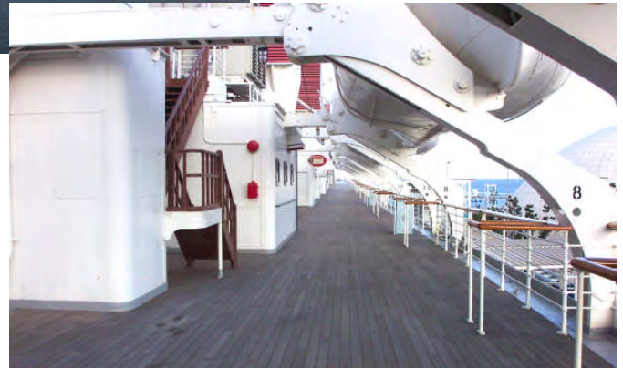
A view along the main deck. No roller skating, please!!

Please don't forget those special hotel rates that the Queen has given us. For an inside cabin, the tariff is just $85.00! But these are lim-