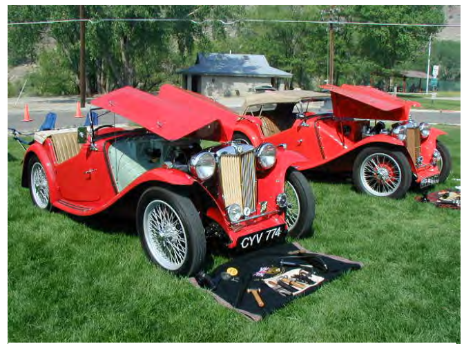
Two of the many fine TC's on display

the parking lot of the DoubleTree Hotel and several times the wind was from the north, moving the smoke into Durango. The eyes burned and the air was foul but the meet went on, pretty much as planned.