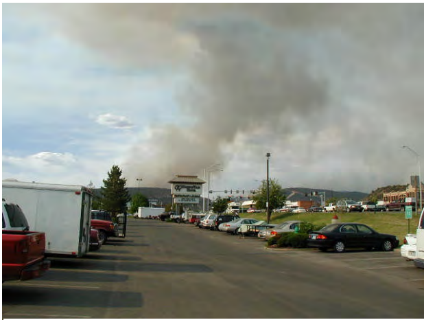
The Missionary Ridge fire could be seen from the Durango, DoubleTree Hotel

Fire, wind, smoke, closed roads, fire damaged restaurants and assorted other hurdles greeted the 125 entrants to the GoF West 2002 in Durango, Colorado. But, not to worry, MG people are used to things not going quite as planned and