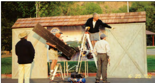
The "foto shoot" backdrop goes together

The awards dinner is always a highlight of the