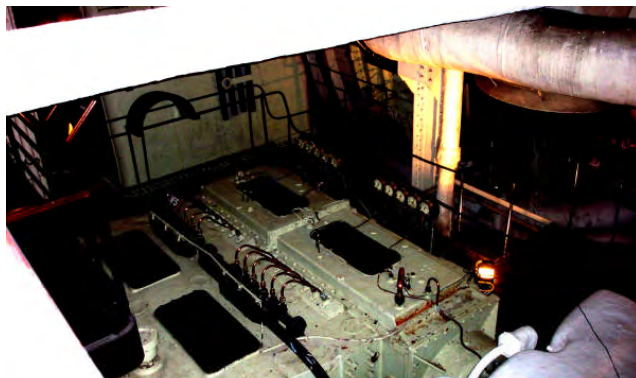
A view of the engine room aboard the Queen Mary