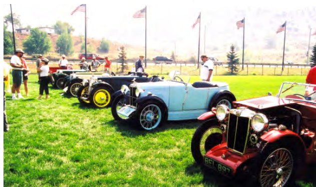
The MMM line-up at GoF West in Durango, CO