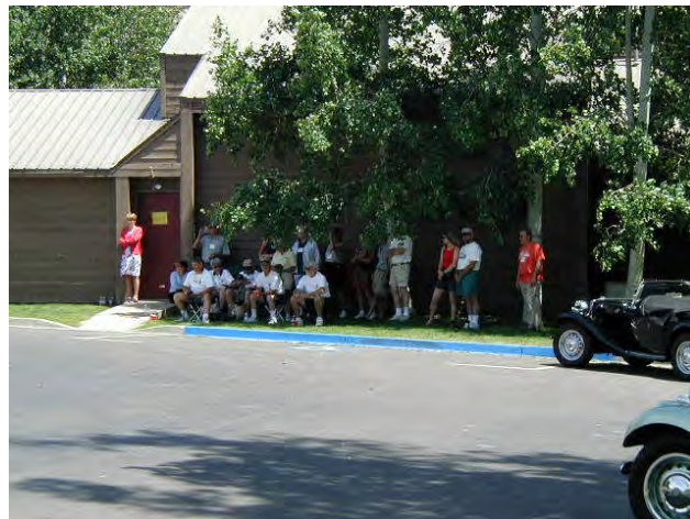
Ah, shade for the funkhana watchers

The tour/rallye planning took the biggest hit during the GoF, as the roads planned for the event had to be changed several times to accommodate the fire problems that caused road closures and detours. Also, the lunch planned at the end of the tour could not be